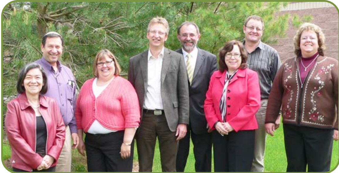
Members of the Professional Providers and Caregivers' Advisory Board (IPWSO) Detail on page 8

Prader-Willi Syndrome Association of South Africa Non-profit Organisation No. 035-837-NPO, PBO Exemption No. 930 016 853, PO Box 2399 Brooklyn Square 0075, www.praderwilli.org.za